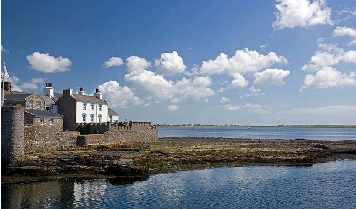
Picturesque ... a beautiful coastal scene on the Isle of Man