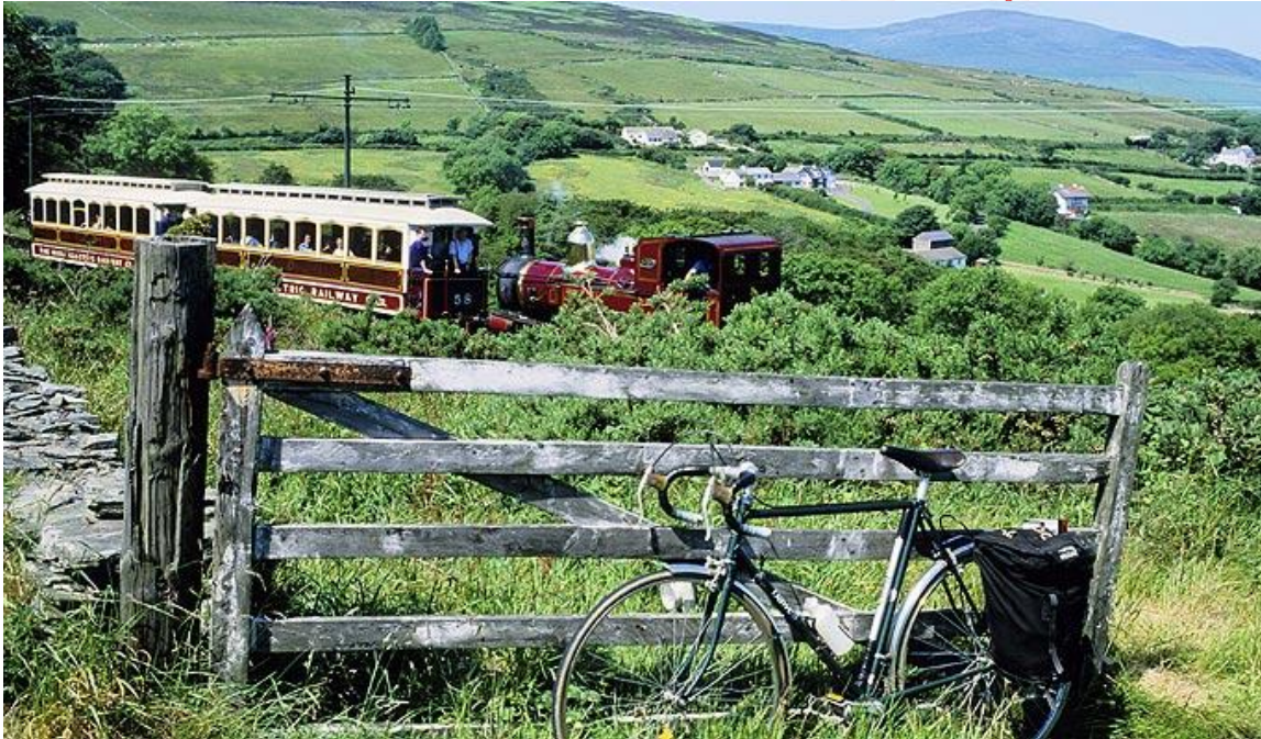
Full steam ahead ... a railway winds its way through wonderful countryside

The man serving us queen scallops had warned of spooky goings-on, grown men being "knocked down to the floor" by unseen presences.